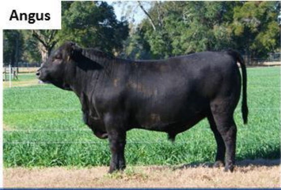
UF UNIVERSITY OF FLORIDA Bull Test ID 923 2011 Florida Bull Test UF UNIVERSITY OF FLORIDA