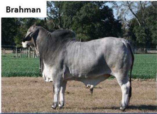
UF UNIVERSITY OF FLORIDA Bull Test ID 983 2011 Florida Bull Test UF UNIVERSITY OF FLORIDA