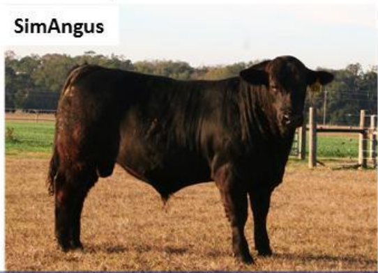
UF UNIVERSITY OF FLORIDA Bull Test ID 939 2011 Florida Bull Test UF UNIVERSITY OF FLORIDA