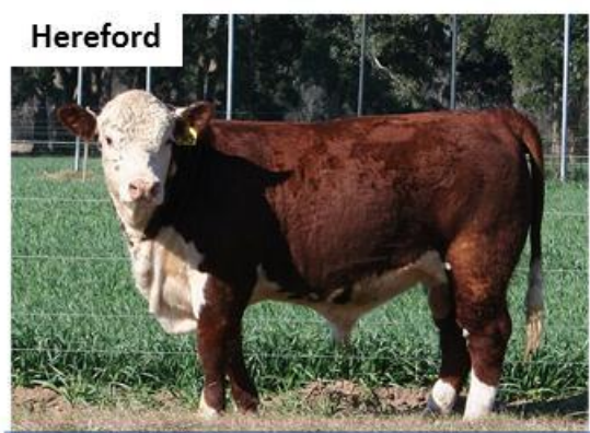
UF UNIVERSITY OF FLORIDA Bull Test ID 945 2011 Florida Bull Test UF UNIVERSITY OF FLORIDA