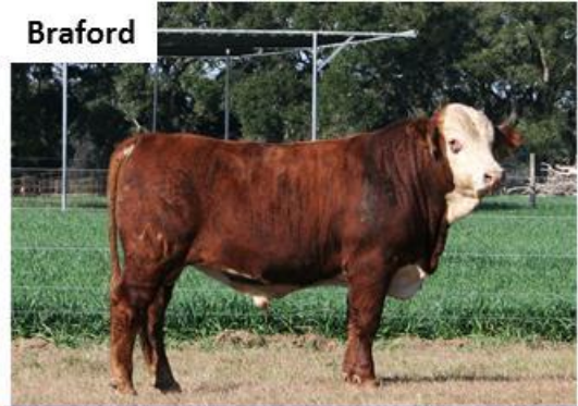
UF UNIVERSITY OF FLORIDA Bull Test ID 926 2011 Florida Bull Test UF UNIVERSITY OF FLORIDA