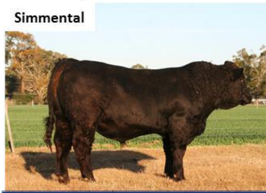
UF UNIVERSITY OF FLORIDA Bull Test ID 940 2011 Florida Bull Test UF UNIVERSITY OF FLORIDA

Additional pictures of all FL 2011 Bull Test Bulls may be accessed and downloaded at our website: