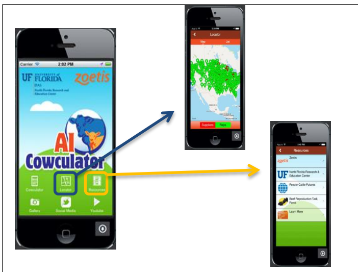
Figure 5. Other icons allow users to: 1) source AI technicians and suppliers of semen and estrous synchronization products (Locator icon); 2) find resources associated with reproductive management of beef cattle (Resources icon); 3) observe a gallery of pictures (Gallery icon); 4) be directed to the AI Cowculator social media sites, such as Facebook and Twitter (Social Media icon); and 5) access Youtube videos associated with the AI Cowculator including a tutorial (Youtube icon).