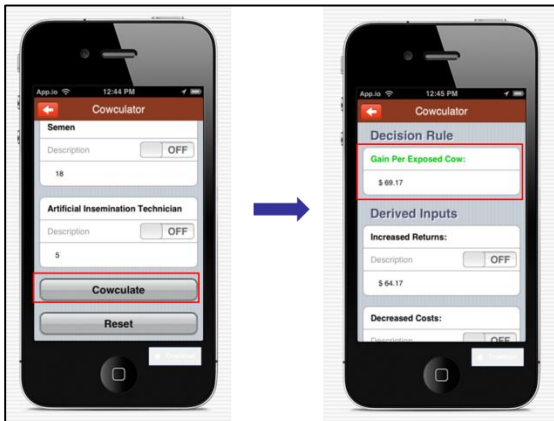
Figure 4. After all inputs are entered users will touch 'Cowculate' resulting in an output screen. A positive value (green) demonstrates that producers should consider TAI and a negative dollar value (red) indicates that producers should not consider TAI.